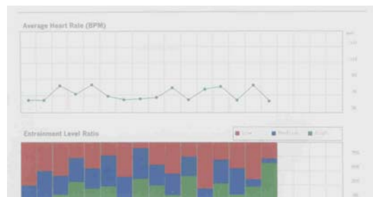
Figure 3. Sessions 10–12

Finally, in Figure 3 (treatment sessions 10 through 12) we see that this child's average heart rate has decreased even further and has become very stable from session to session (note that there are no extreme spikes in this record). His ability to generate medium to high heart rhythm coherence has increased substantially, indicating increased nervous system stabilization and increased synchronization and harmony in the activity of the heart, brain, and other bodily processes. Of particular note is the fact that this child had a cardiac arrhythmia at the beginning of the training program, which was no longer present at the end of the sessions; this was confirmed by cardiologist Dr. Hector Briseño.